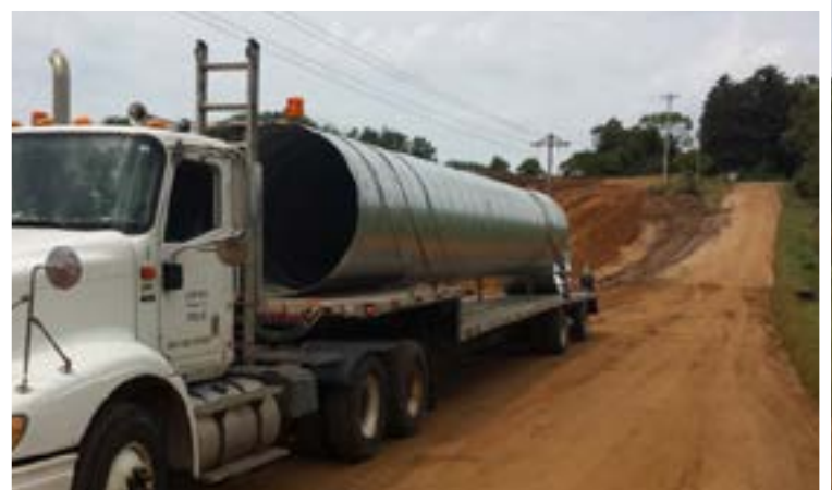
Road Construction Update: New, larger culverts have been installed to ensure a proper drainage system.