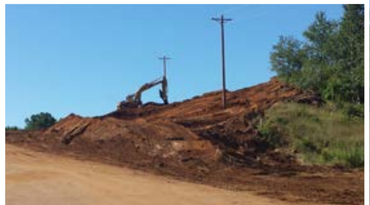
Road Construction Update: In order to increase visibility and soften the corner at the south edge of the QGS facility, a large hill is being lowered.