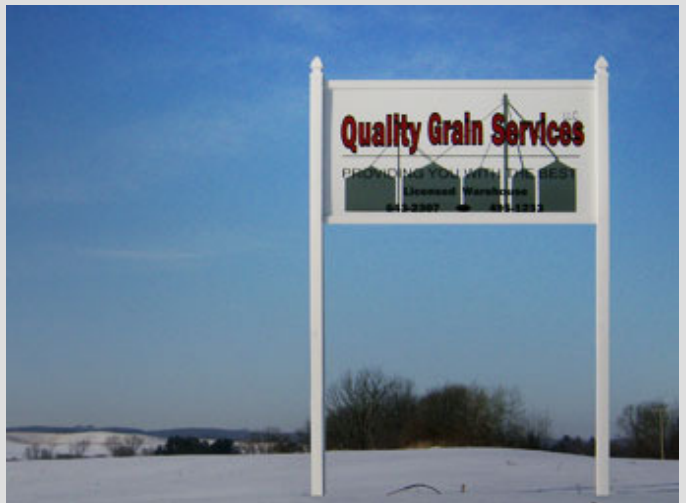
The New Sign, Viewed From Highway 64

Looking for us in the phone book? Quality Grain Services is not currently listed, however, our contact numbers are (715) 643-2307 and (715) 495-1233. Feel free to contact us- our new part-time secretary will be here to take your call!